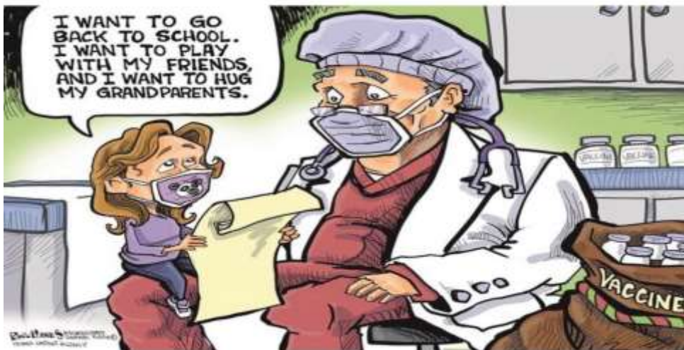
Figure 1: Taken from Syracuse dated Dec. 20, 2020