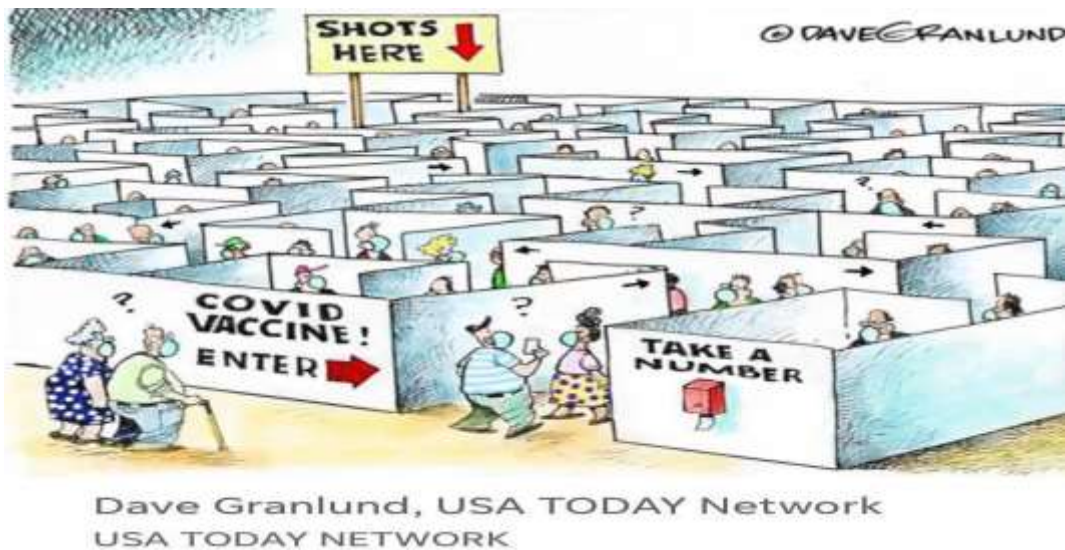
Figure 4: dated Jan. 11, 2021